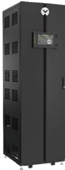
Vertiv™ EnergyCore Battery Cabinet

The cabinet has successfully passed UL 9540A thermal runaway testing. According to NFPA 855's ESS installation standards, when successfully completing a UL9540A test, the three feet (92cm) spacing requirement between racks can be waived by the Authorities having Jurisdiction (AHJ) and free up valuable white space in a data center.