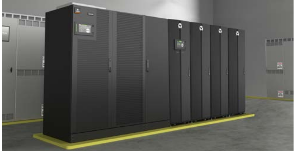
Vertiv™ Liebert® EXL S1 with Vertiv™ EnergyCore Batteries