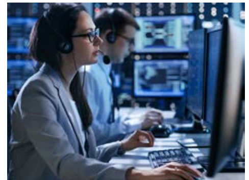
Support Services for Critical Facilities

From maintenance to replacements, you can count on Vertiv to keep your energy storage working for you.