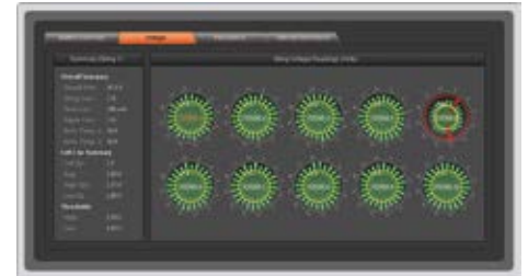
Vertiv™ Albér™ Battery Xplorer Enterprise